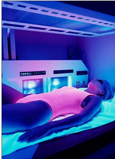
Crackdown ... sunbeds

"Sunbed use, particularly under the age of 35, significantly increases the risk of developing skin cancer in later life."