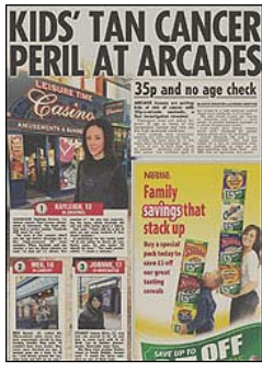
Shock ... Sun story

A Cancer Research UK spokeswoman said: "We are delighted."